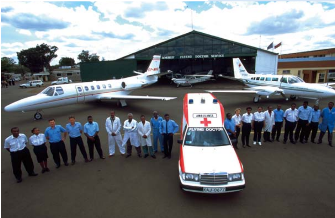
AMREF Flying Doctor Service medical staff and flight staff