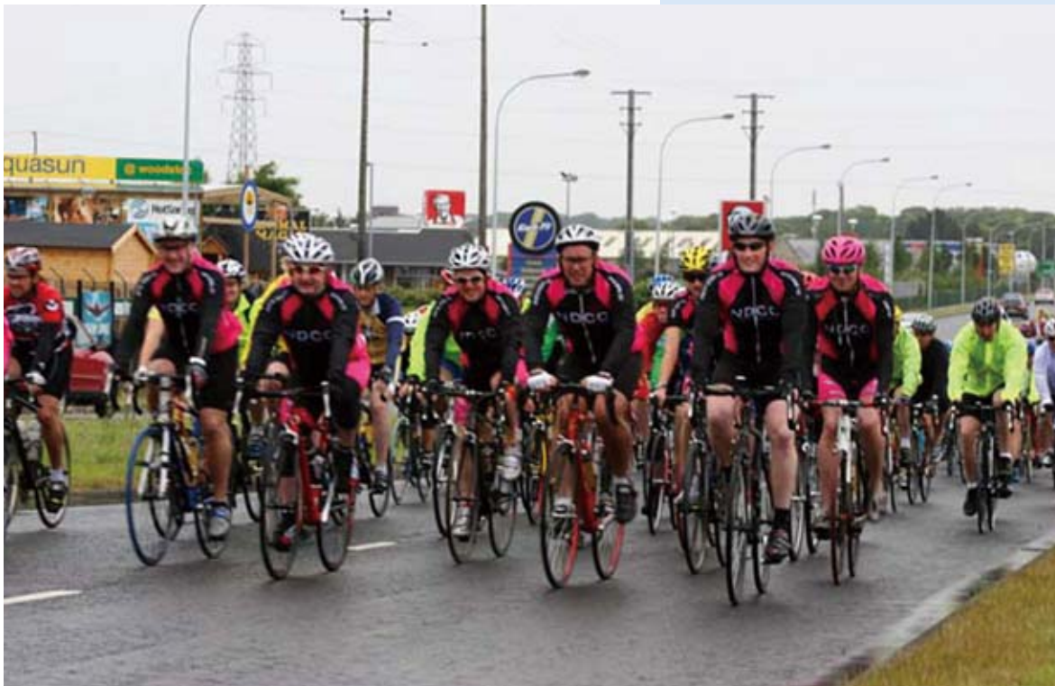
Cyclists in the Bangor Coastal Challenge charity cycling event

Consultant Endocrinologist, The Ulster Hospital, Belfast