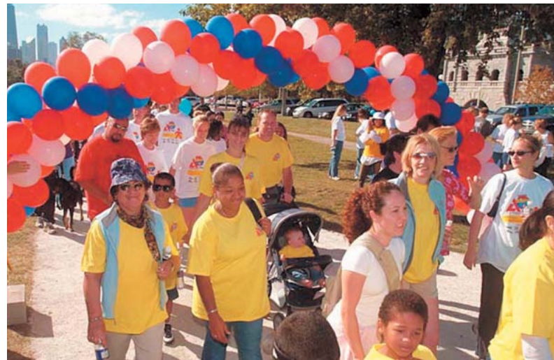
TPNA employees participating in "ADA Walk"

● The Sumatra-Andaman earthquake and tsunami in December 2004: Takeda made a donation of 10 million yen as well as a matching gift to support UNICEF's relief efforts for child victims of the disaster. The matching gift totaled about 10 million, of which half was raised from the labor union and employees and the remaining half came from the Company. The contribution to the victims of the Sumatra-Andaman earthquake and tsunami; including donations, pharmaceuticals and other healthcare products from Takeda Group affiliated and related companies, was equivalent to a total of around 100 million yen.