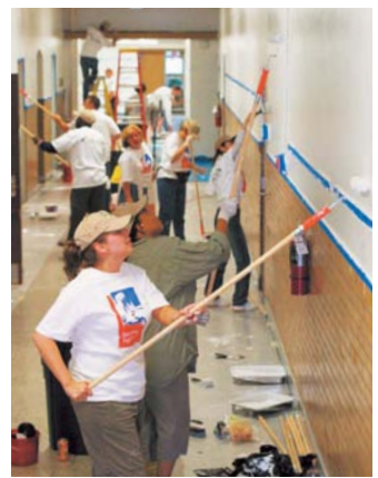
TPNA employees participating in refurbishing operation of the building

TPNA is a major sponsor of Rebuilding Together, an organization dedicated to preserving and revitalizing low-income houses and communities. In August 2004, more than 220 employees of TPNA and TGRD participated in painting, refurbishing and landscaping the building of Andrew Cook Magnet School in Waukegan, Illinois, U.S. In October 2004, 70 sales representatives helped to refurbish and landscape a day-care center in Chicago, and all materials, such as paint, were donated by TPNA. These activities serve as a good opportunity for employees to develop their leadership skills and learn about teamwork as well as contribute to society by providing support for those in need.