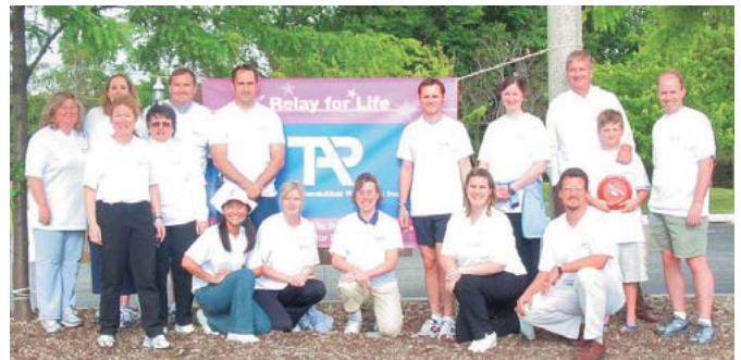
TAP employees participate in events sponsored by the American Cancer Society

[In the United States] The Takeda Group is committed to providing access for patients most in need. Takeda Pharmaceuticals North America, Inc. (TPNA), a 100 percent Takeda-owned subsidiary, has implemented a "Patient Assistance Program" for distribution of the anti-diabetic drug ACTOS® to certain low-income patients. In 2005, TPNA is participating in the "Together Rx Access Card Program," alongside eleven other pharmaceutical companies. This program allows patients to buy drugs at a discount rate. TPNA seeks to inform audiences about discounted product available to low-income patients through our Patient Assistance Program. In addition, TPNA sponsors the "America's Walk for Diabetes" organized by the American Diabetes Association (ADA) in the form of donations by TPNA and its employees, and participation in the events. TPNA and TAP Pharmaceutical Products Inc. (TAP), a joint venture between Takeda and the U.S. firm, Abbott Laboratories, participate in the "Daffodil Days" program, sponsored by the American Cancer Society. Participants in the programs send handmade bouquets of daffodils, a symbol of hope, to cancer patients and hospitals.